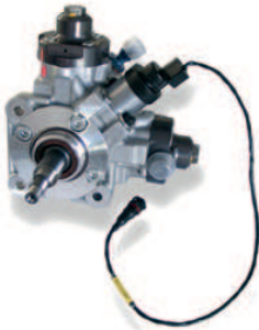
Common Rail Pumps